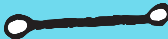
cotton bud sticks