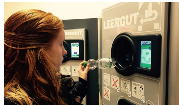
Customer using a deposit return machine in Germany – TOMRA via Surfers against Sewage (2017)

DRS offer an incentive for returning plastic bottles by adding a reclaimable amount to the price of bottled drinks. In Germany, where DRS machines are located in places such as supermarkets, 99 per cent of plastic bottles are recycled. 12 Following the success of the plastic bag tax in England, DRS advocates are calling on the Government to take a similar proactive approach to plastic bottles.