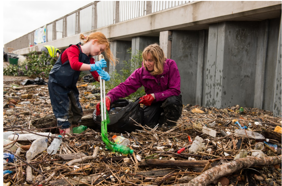
Volunteers removing plastic waste from the Thames

We welcome your thoughts and comments on how to reduce the impact of bottled water consumption in London. You can get in touch with us at EnvironmentCommittee@london.gov.uk